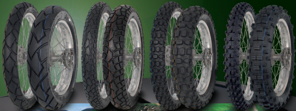
INVADER MC 30